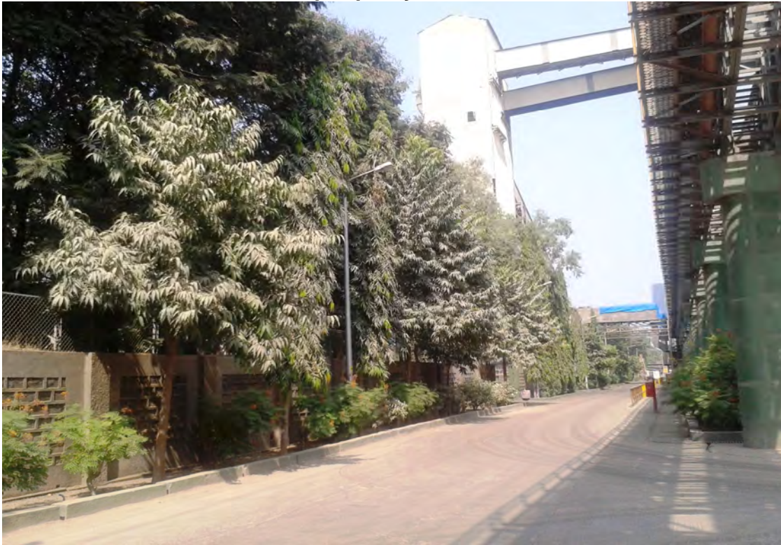
Greenery inside Thermal Power Plant